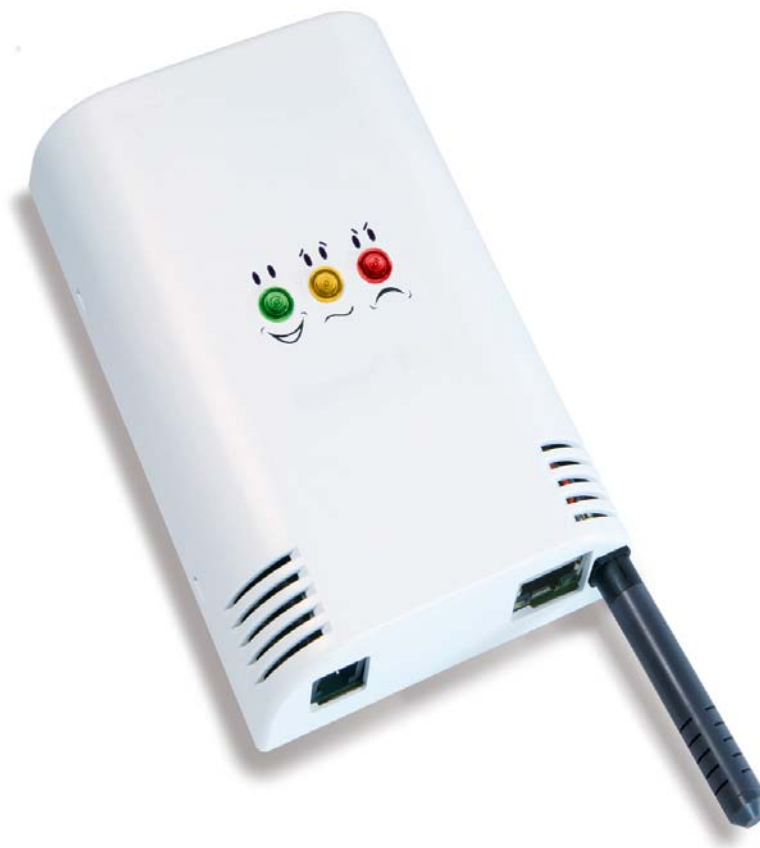
Fig. 1: AQ-CLIMATE CONTROL sensor system.

A two-beam infrared sensor (NDIR) is mounted on a sensor holder inside the plastic housing and above a diffusion opening to measure the carbon dioxide concentration. The sensors for the relative humidity (15 to 95 % RH) and temperature (0 to 50° C) are located in a sensing element made of PVC protruding from the bottom of the housing. The microprocessor for processing data, the digital outputs and an actuator (relay contact) are additionally integrated in the housing (see Fig. 1).